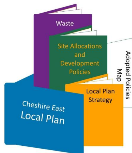
Figure 2.1 Content of the Local Plan